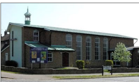
The United Reformed Church, Brookmans Park

Much of the voluntary work currently undertaken in the Parish is promoted by our Churches