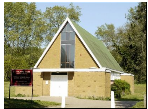
St. Thomas More Church, Welham Green

Much of the voluntary work currently undertaken in the Parish is promoted by our Churches