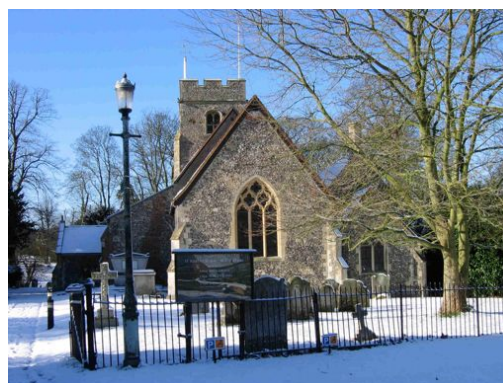
A view of St. Mary's Church, North Mymms

The top two locations identified in response to the question, “What is your favourite part of the Parish?”