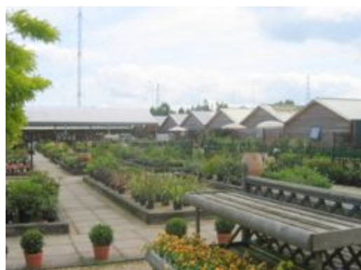
Gardening - a much enjoyed activity