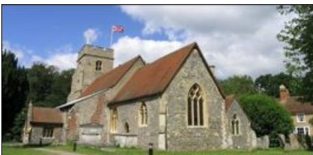
St. Mary's Church, North Mymms