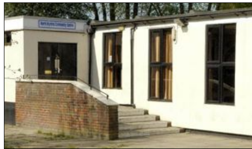
North Mymms Youth and Community Centre