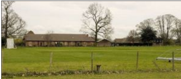
North Mymms Cricket Club

of 5.5% or less. Such a wide range of interests supports the need for clubs to offer membership across a wide geographical area and for local residents to be prepared to travel in order to participate in the activity of their choice. It is unlikely that North Mymms could ever offer club attractions to meet such diverse demands. The aim is therefore to establish a list of Clubs and activities within and beyond the Parish for communication to residents via the internet, libraries and doctors' surgeries etc. It was felt that whilst there are many clubs and societies, information about them is not readily available.