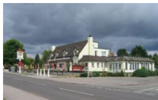
The Sibthorpe Arms, Welham Green