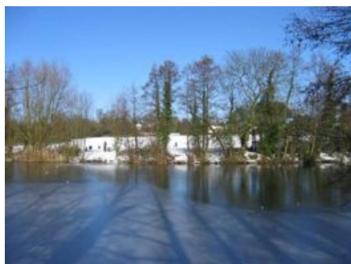
A view of the lake in Gobions Open Space in Winter

Local shops can be found in Brookmans Park and Welham Green. Many of our residents commute to London to work but we have a strong community spirit and various organisations, clubs and societies have been formed. Many people see our Parish as a pleasant place to live but many residents consider that they live in one of the villages and do not feel that they “belong” to the somewhat larger Parish. The identity of the Parish needs to be developed and perhaps the achievement of some of the projects set out in the Parish Plan will help in this aim.