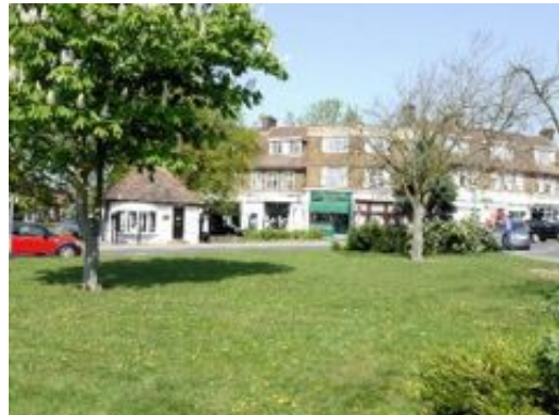
Views of Bradmore Green, Brookmans Park