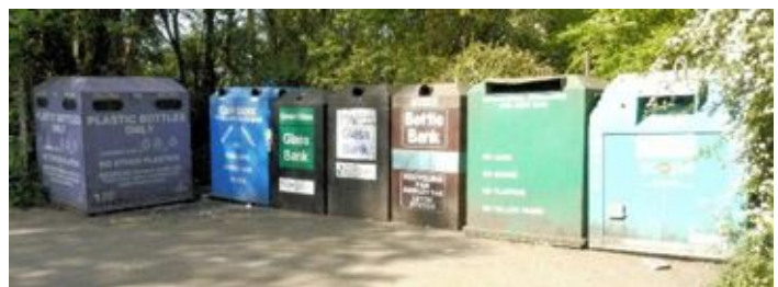
Recycling facilities at North Mymms Youth and Community Centre

The most frequent (54%) proposal for improvement was for recycling of plastic. No doubt the subsequent introduction of fortnightly plastics collection is much appreciated. The validity of the