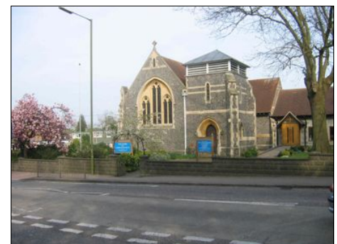
Christ Church, Little Heath