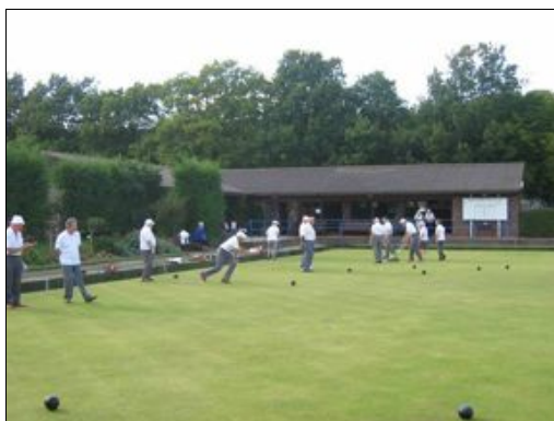
North Mymms Bowls Club