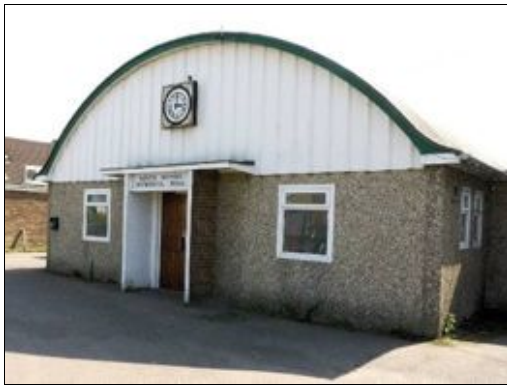
North Mymms Memorial Hall