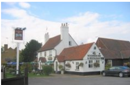
The Woodman at Water End

In support of a need to foster community spirit and good neighbourliness, the Leisure Working Group proposes two added initiatives namely: a North Mymms Internet Radio station facilitating cross-generation involvement and a Time-banking scheme in which participants “deposit” their time in the “bank” by giving practical help and support to others and are able to 'withdraw' their time when they need something done themselves. Each credit might be worth one hour of time. Participants could spend their time credits on the skills and support of other participants when they need a helping hand. It is a volunteer scheme for those with a skill or time to share with the community. Such a scheme would require a data base of people and skills. It would foster improved community spirit and cross-generation sharing.